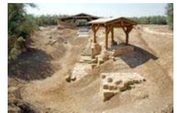
The excavated remains of the baptism site in Bethany beyond the Jordan, in modern-day Jordan.